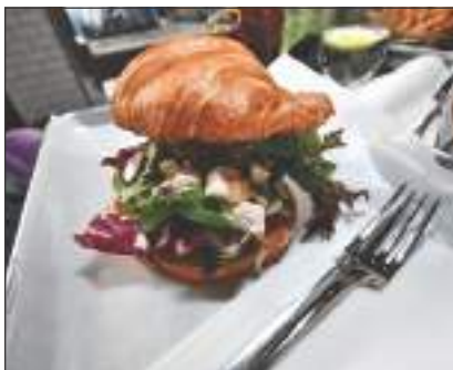
The chicken salad is scrumptious!

The restaurant is cleverly appointed with nostalgic bits and pieces reminiscent of the old drugstore. The white marble counter, the chrome bar stools and the big, lighted "DRUGS" sign are all memory-inspiring.