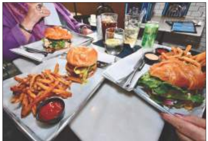
The People's Burger next to the Chicken Salad Croissant.