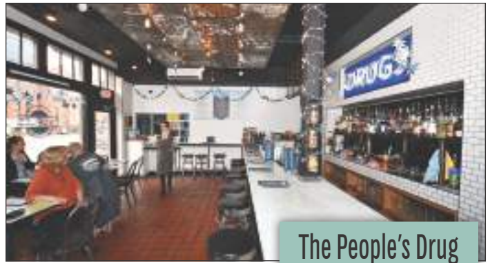
The bar is open!

In addition to the uniquely prepared food offerings, the restaurant has become known for their Signature Craft Cocktails. Their popular Happy Hour is daily, 3-7pm. Check out the artistic libations with clever names like Alfred's Penicillin - Power's Irish whiskey, Laphroaig, cinnamon brown sugar, grapefruit juice and rosemary tincture. Or on a brisk day, perhaps Hazel's Hot Cocoa would hit the spot - citrus vodka, hazelnut orgeat and hot cocoa crowned with torched marshmallow.