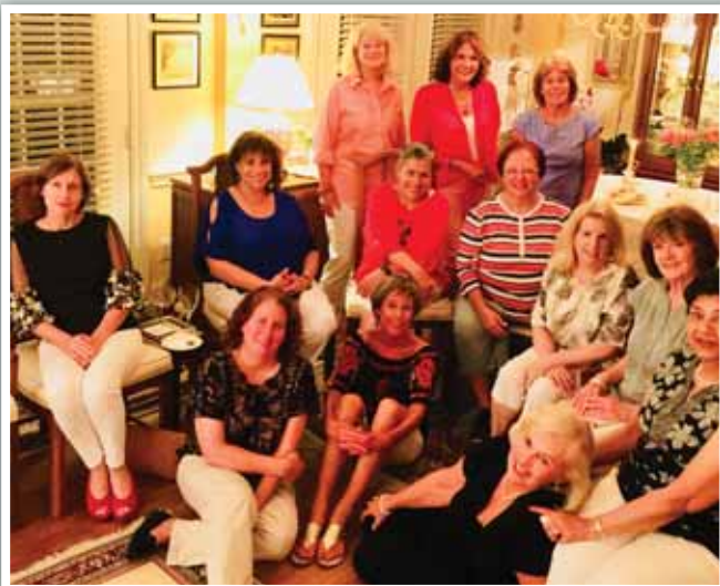
The August meeting of Reading Between the Wines.