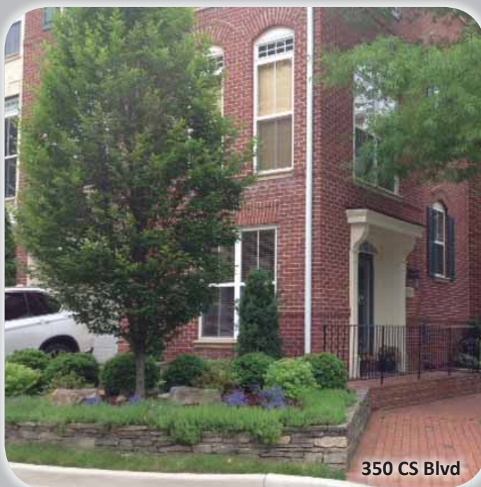
350 CS Blvd